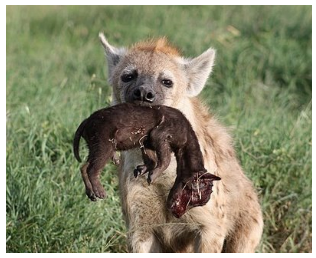
Cub's head crushed most likely by sibling

Furthermore, mothers do not even intervene in these fatal contests for dominance. Because of this violent practice, baby hyenas are often identified as the Cain and Abels of the mammals. Also, it is reported that, here again, it is often the female that prevails in the battle. The resulting death rate from this siblicide is reported to be anywhere from nine to twenty-five percent. However, one researcher observed that at a few weeks of age, "more than forty percent of the litters comprised lone cubs." This practice is documented in the opening portion of the video, "Survival Guide," as well as in a segment of "Eternal Enemies."